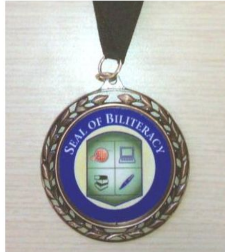
Californians Together Seal of Biliteracy Medallion: Senior