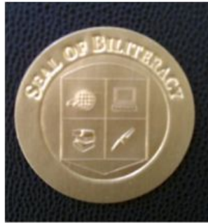
Californians Together Senior Seal

Go to the Californians Together website to order the materials or call the office for more information at (562) 983-1333 (Shipping and taxes will be added to all orders)